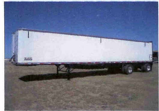
4684542 93 yard 15,750 lbs 10'-2" spread