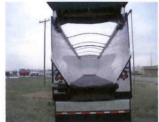
Fully lined interior. 54" wide belt / 60° slants 3/8 floor plastic