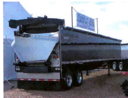
4266542 59 yard 14,040lbs