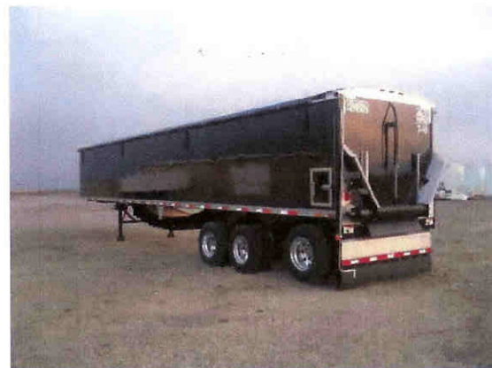
4872543 82 yard 17,500lbs