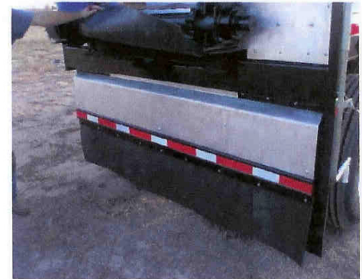
Full width product guard.