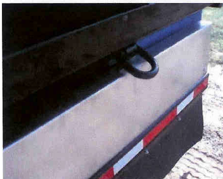
Tow Rings Available