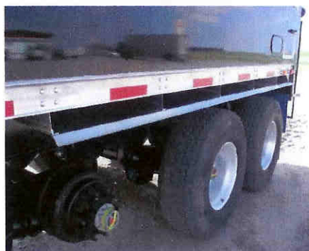
Optional Bolt-on Fenders