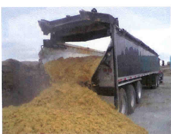
Unloading wet distillers grain.