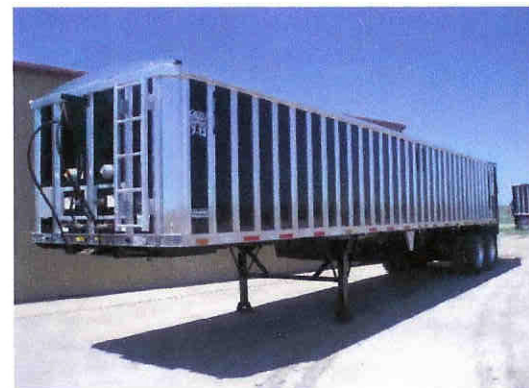
4266542 59 yard 13,650lbs

Manufactured by Valley Farm Ind. LLC of Benkelman, Nebraska