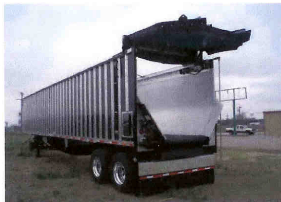
4684542 93 yard 15,140lbs